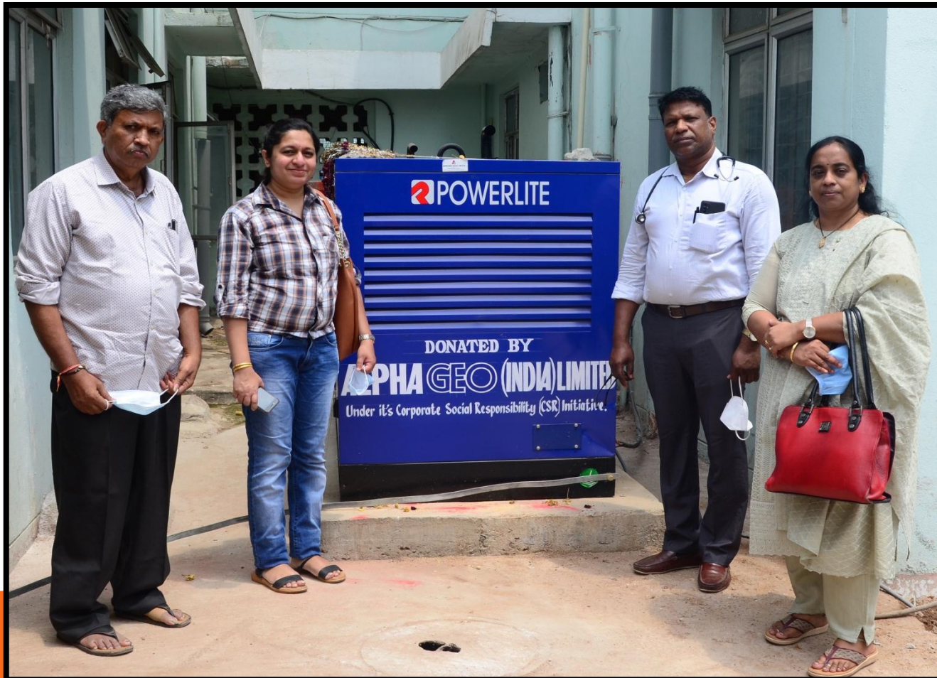
Visit by Chief Financial officer and Company Secretary at Community Health Centre, Ghatkesar, Telangana